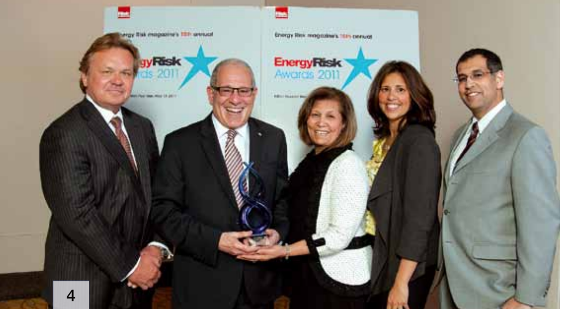
4. The ZE PowerGroup team, Data Management House of the Year