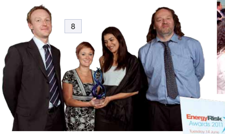
8. Société Générale Corporate & Investment Banking's base metals team, winners of Base Metals House of the Year